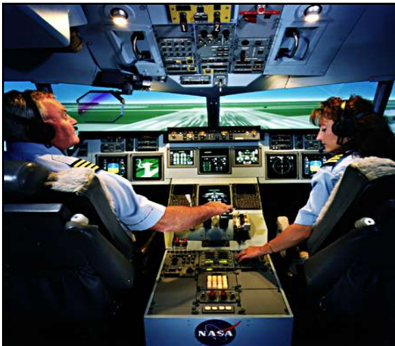
Figure 1 Flight Simulator (NASA)